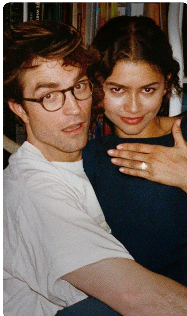
Pictured: The Drama